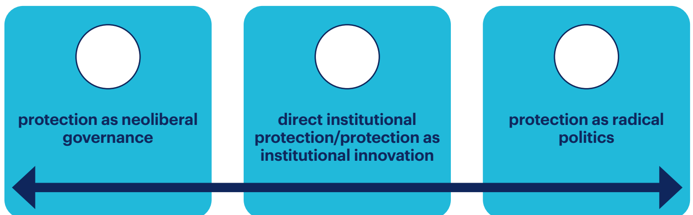
Figure 1. Continuum/spectrum of protection

The next point on the continuum is direct institutional protection and innovation , which describes institutional spaces, setups, and policies around more direct forms of protection and lines of accountability. These arrangements may be nested within neoliberal modes of governance – but not necessarily – and are considered to form part of its protection apparatus. Protection may be based on policy