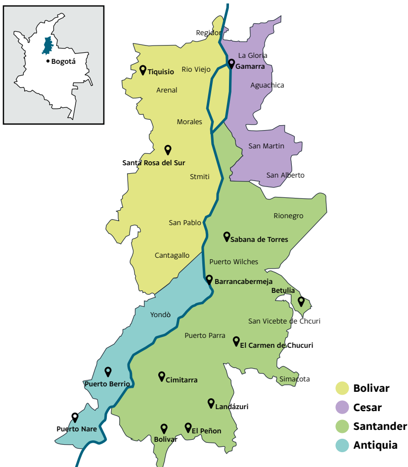
Figure 1. The Magdalena Medio region

The second community, the ACVC, was created in 1996 after several peasant protests took place between September and October 1996 in San Pablo and Barrancabermeja. It is composed of 120 Community Action