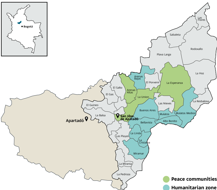
Figure 2. Location of the settlements of the Peace Community of San José de Apartadó within the municipality of Apartadó

Lastly, the CdPSJA was created on 23 March 1997 in the small township of San José de Apartadó (Figure 2). The birth of this peasant community symbolised the convergence and confluence of several processes. As shown by Aparicio (2012), the experience of tenant farmers fleeing from paramilitary groups, the activism of political parties and organisations, and the action of national and international NGOs based on international humanitarian and human rights norms all fed into the creation of the CdPSJA. It is now one of the best-known peasant communities in Colombia.